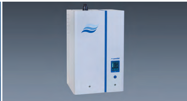
Condair EL steam humidifier