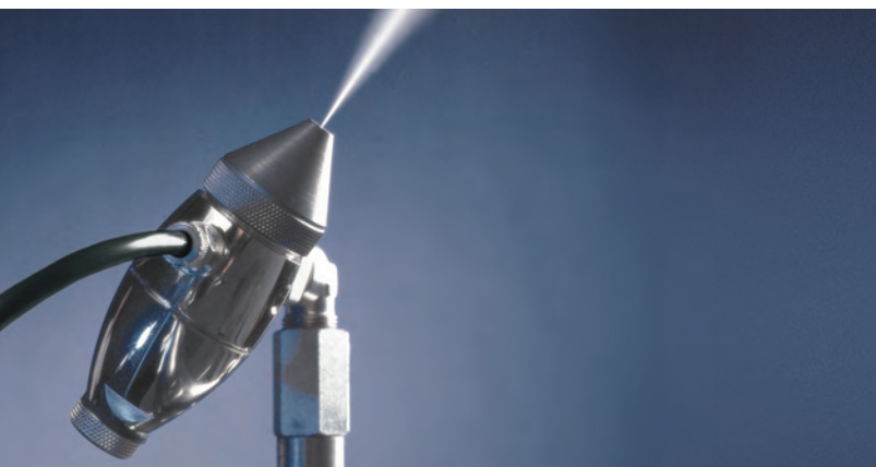
JetSpray compressed air & water humidifier