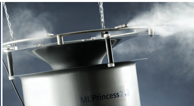
ML Princess high pressure humidifier